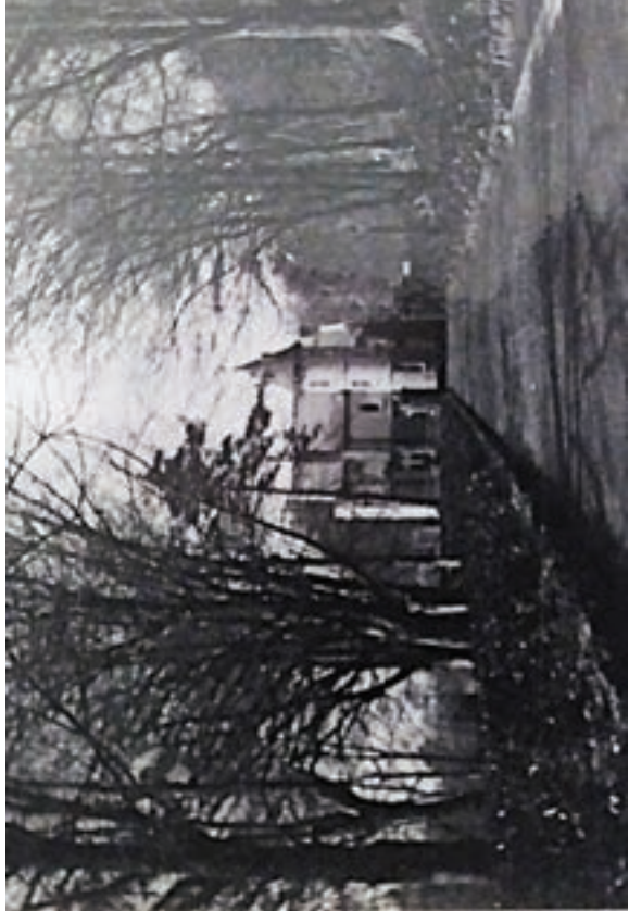
Plate 3.10: Kearsney Court - c1903 view of the house from the main drive