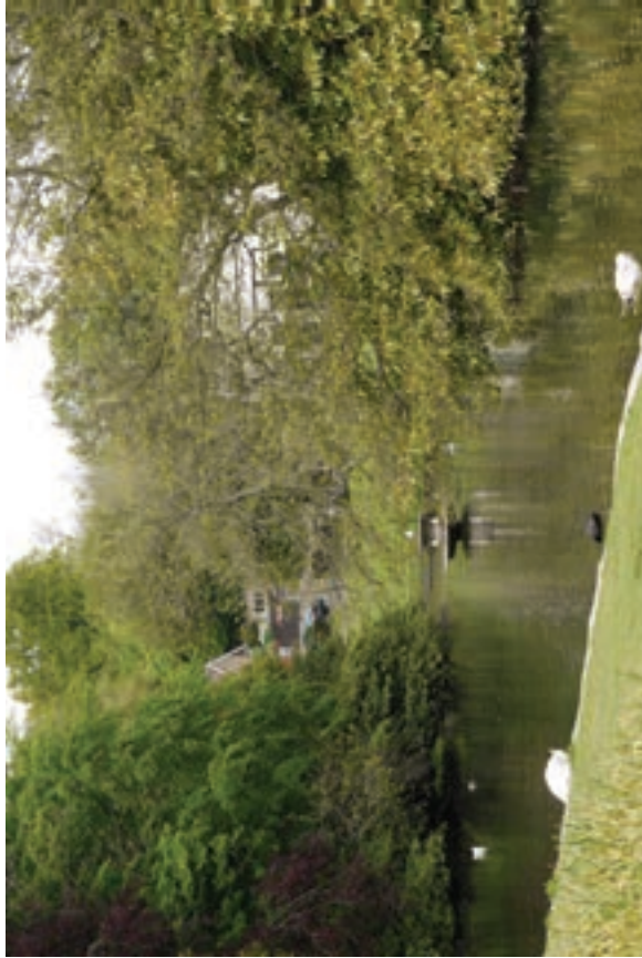
Plate 3.1: Kearsney Abbey - lake pre-war postcard and view today