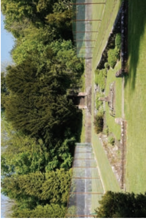
Plate 3.9: Kearsney Court - c1902-3 view of from the Lily Pond, courtesy Christopher Mawson