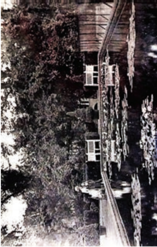
Plate 3.11: Kearsney Court - 1907 Lower Lily Pond, and the view today