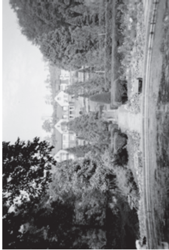
Plate 3.16: Kearsney Court - Mid century view of the main axis and the view today