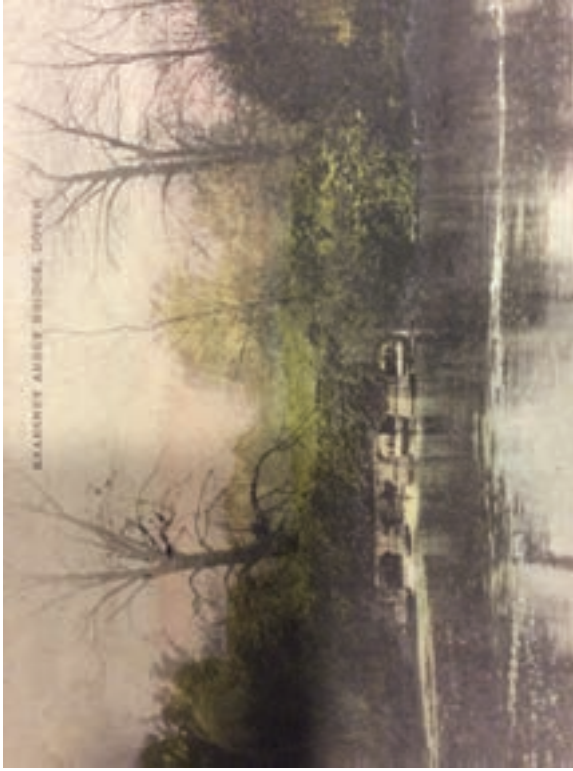
Plate 3.3: Kearsney Abbey - early C20 postcard of the eye-catcher feature, and view today