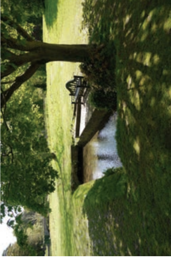
Plate 3.7: Kearsney Abbey - 1975-77 Cllr Peter Bean planting a tree and view today