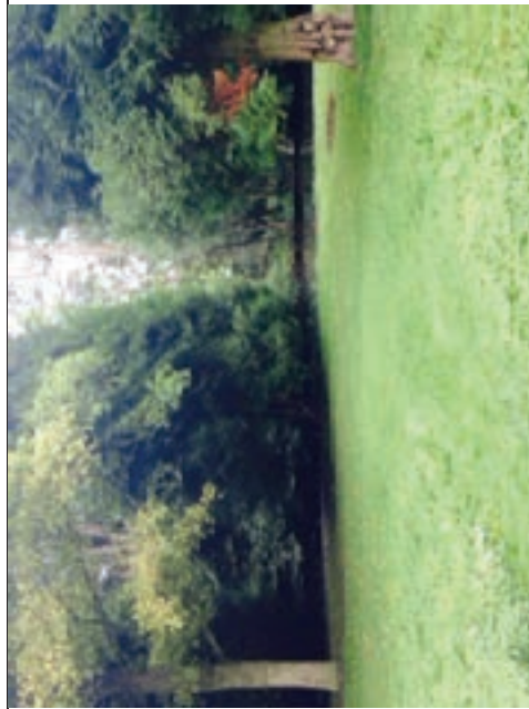
Plate 3.2: Kearsney Abbey - pre-war postcard from the south – note estate fencing, and view today