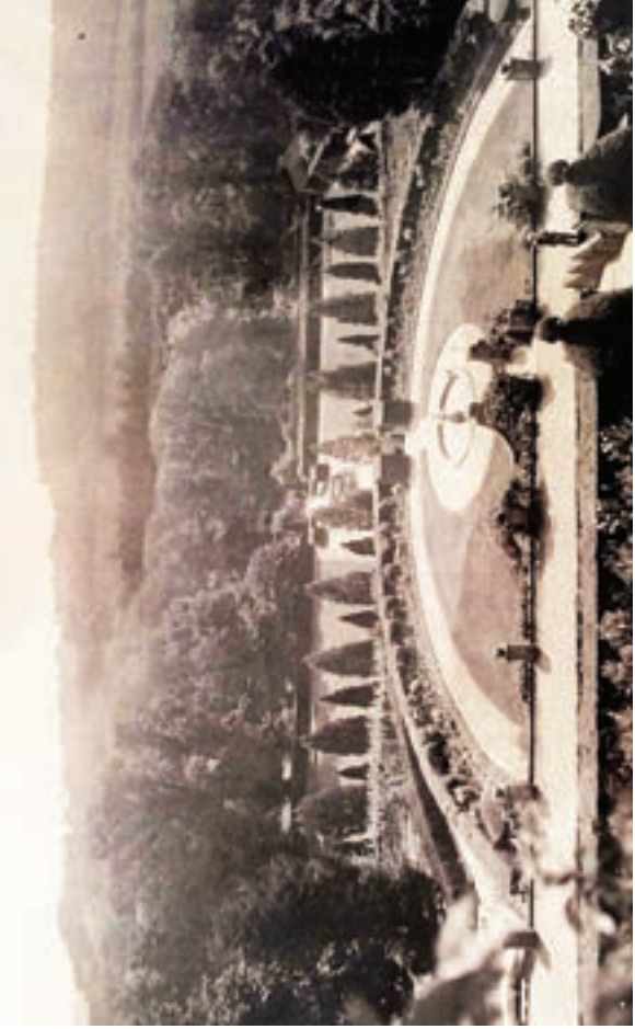
Plate 3.13: Kearsney Court - 1912 Sales Brochure 'View fro the House and Terraces', and post 1920