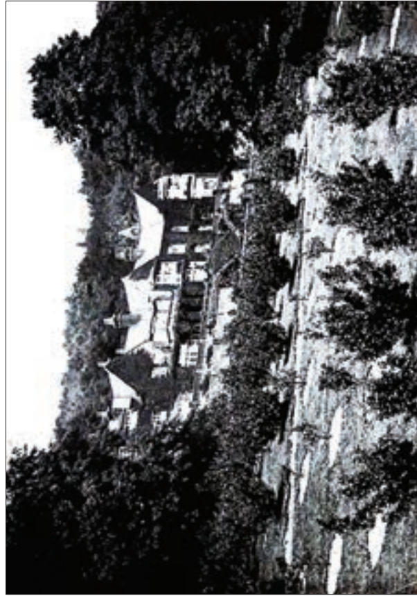
Plate 3.12: Kearsney Court - 1912 Sales Brochure 'The South Front'