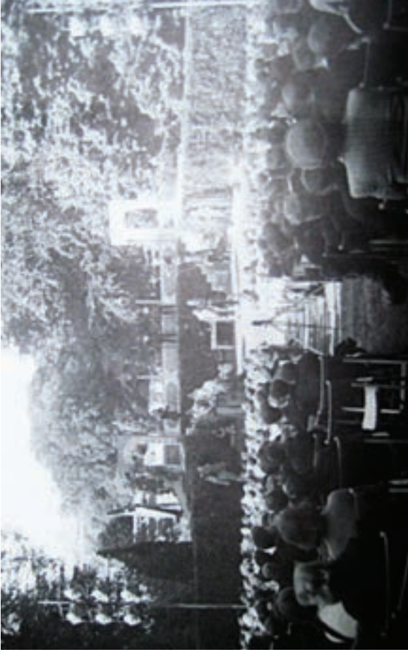
Plate 3.5: Kearsney Abbey - Post 1955