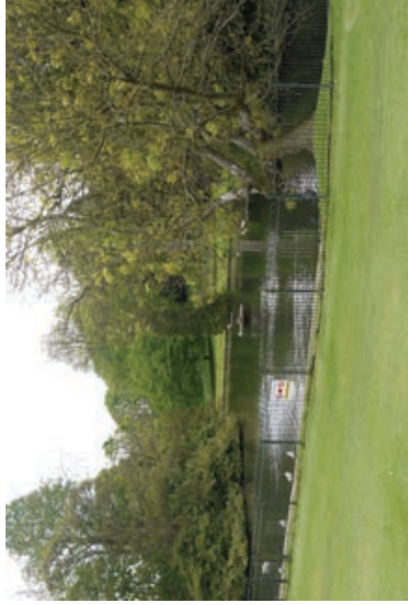
Plate 3.8: Kearsney Abbey – post war view south down the main avenue and view today