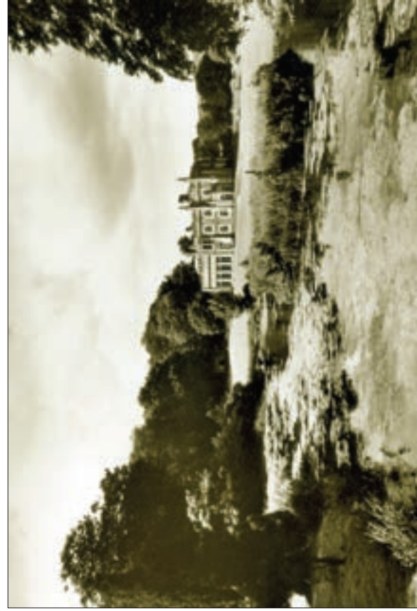
Plate 3.4: Kearsney Abbey - post 1950 photograph and current day view