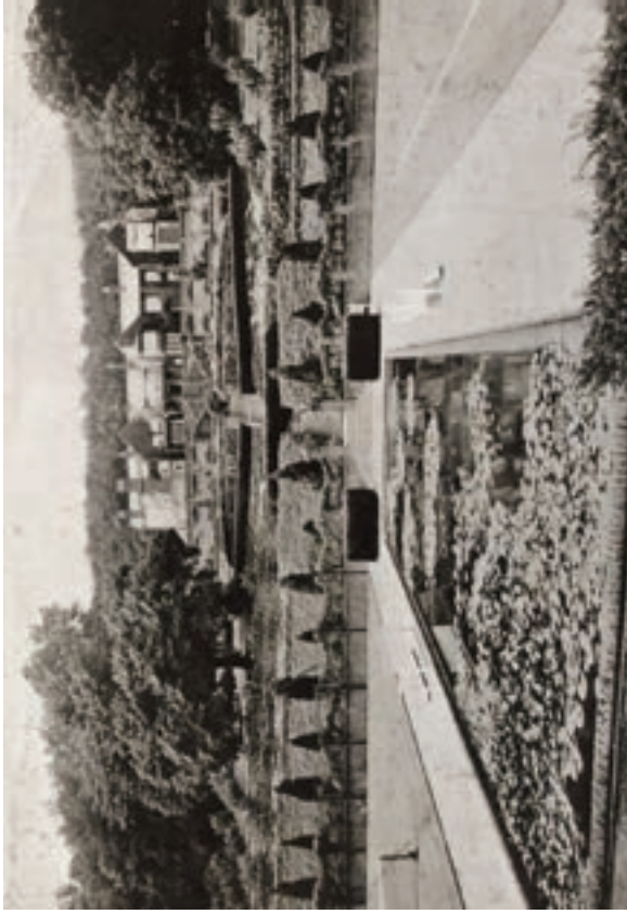
Plate 3.15: Kearsney Court - 1912 Sales Brochure view of the main axis